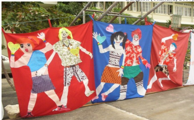
Tapori Silhouettes for October 17 th celebrating in partnership with UN/ESCAP and the Ministry of Social Development and Human Security, Bangkok (Thailand, 2007)

After several months of thinking about it, I discovered how to approach them. Today, if I see an older woman, I say to her: “Auntie, please, allow me to help you, because I wish I could do the same for my mother. This situation is not your fault, you don't have a choice. As soon as I saw you, I couldn't help but remembering the respect I owe my mother, but, unfortunately, she has passed away. My heart is full of regrets, because now it is too late to show her my respect, as she is no longer with us. Please, accept that I help you, so that it will help me overcome my regrets.”